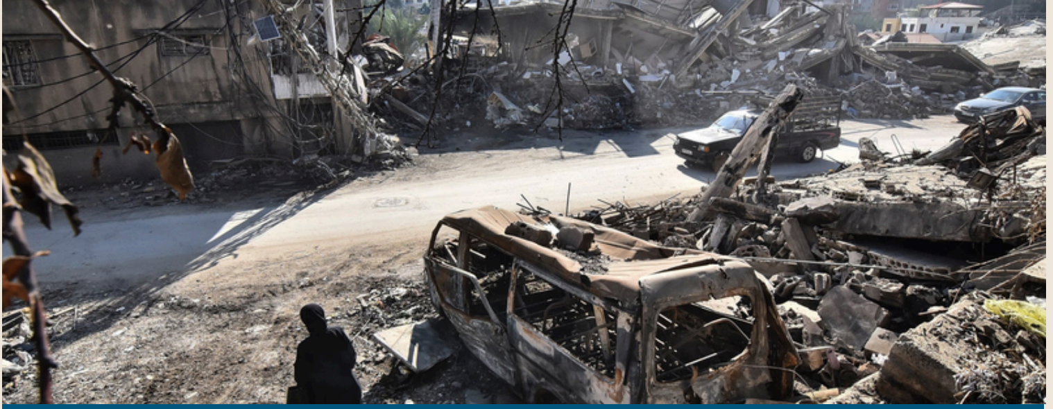
A returning resident to Nabatieh, in southern Lebanon, stands before the wreckage in the city on November 30, 2024, days after the start of a ceasefire between Israel and Hezbollah.

فالدنيا كوني ليست مجرد استجابة لاحتياج طارئ، بل هي تجسيد لإيمانٍ حيٍّ يرى في كل إنسان صورة الله، وفي كل عمل رحمةً بذرةً لسلامٍ حقيقي.